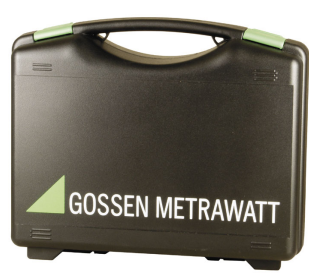
F836 Ever-Ready Case For multimeter and accessories

For two multimeters (with/without protective rubber holster) and accessories